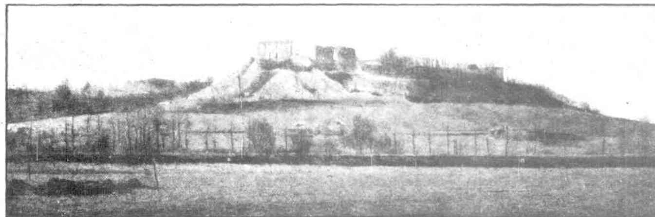
AFTER IT WAS BLOWN UP BY 25 TONS OF GERMAN EXPLOSIVE.