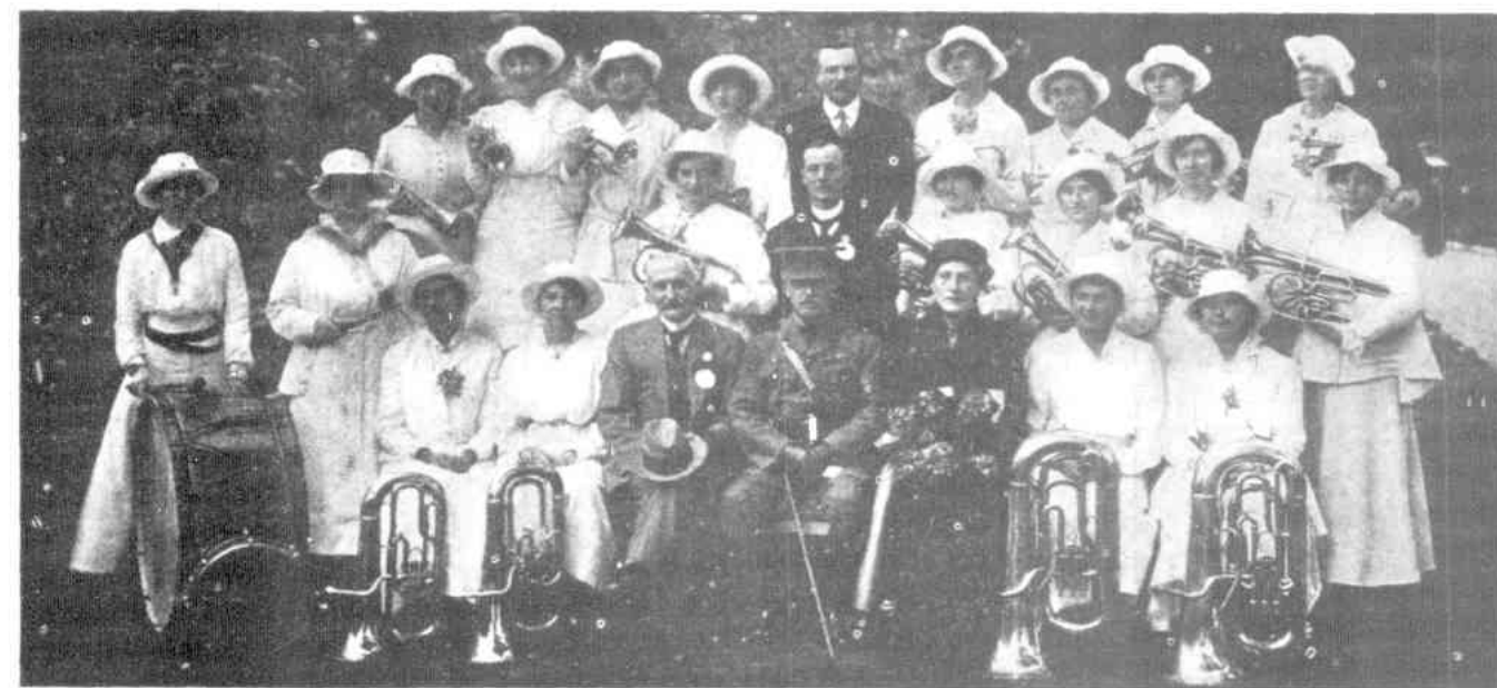
The Barra Ladies' Band took a prominent part in the Violet Day proceedings in Adelaide last week, and their performances were highly appreciated.