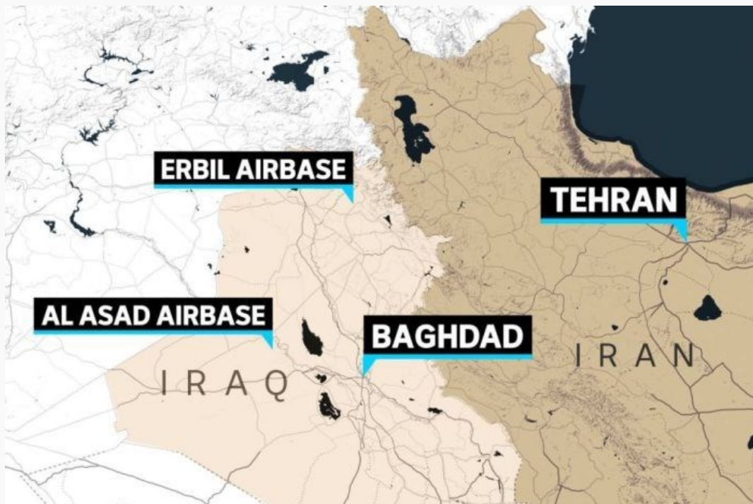
PHOTO: Erbil airbase and Al Asad airbase were hit in the attacks.