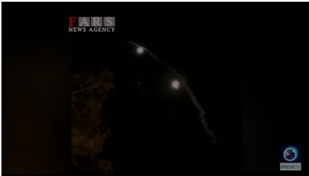
VIDEO: Iranian Revolutionary Guard missiles hitting Al Asad airbase

Mr Trump's reaction in the immediate aftermath of the attacks had been to say on Twitter , "All is well!" and that Washington was assessing damage.