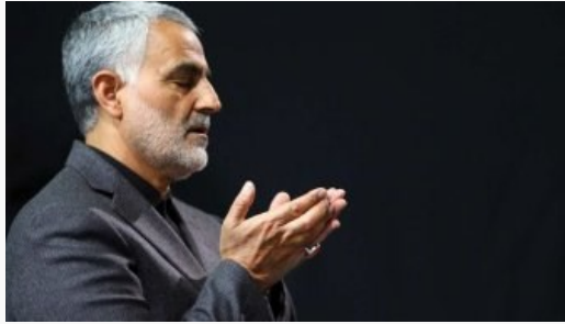
The death of Iranian Major General Qassem Soleimani is a watershed moment, even in the long and bloody history of Middle East conflict.