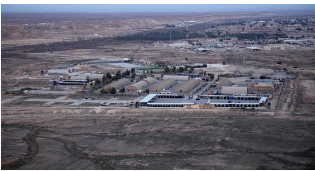
PHOTO: The Al Assad airbase in Iraq was targeted by Iranian missile strikes. (AP: Nasser Nasser)

Iraq's Foreign Ministry said it rejected Iran's missile attack on Iraqi military bases housing US troops and would summon Tehran's ambassador in Baghdad to convey its protest.