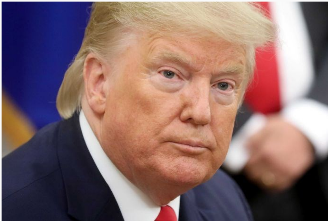
PHOTO: US President Donald Trump has made a statement about Iran.

United States President Donald Trump says Iran appears to be "standing down" and no Americans have been harmed in ballistic missile strikes on two Iraqi bases housing US troops.