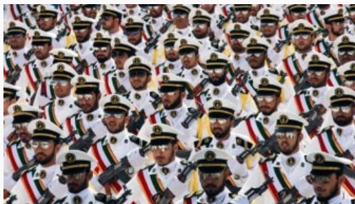
Iran and America's tensions are at fever-pitch. Here's a breakdown of what we know about the two militaries and what we might expect.