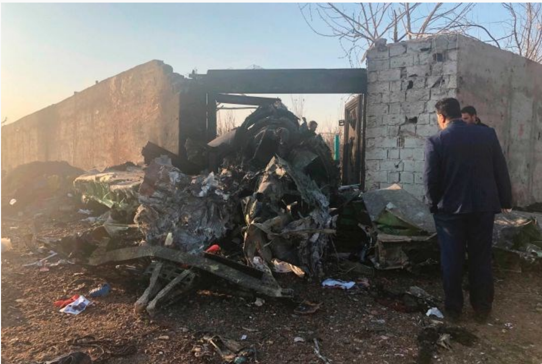
PHOTO: The plane crashed on shortly after take-off from Tehran's main airport.

"If it had not been concealed, the head of civil aviation and the government spokesmen would not have persistently denied it."