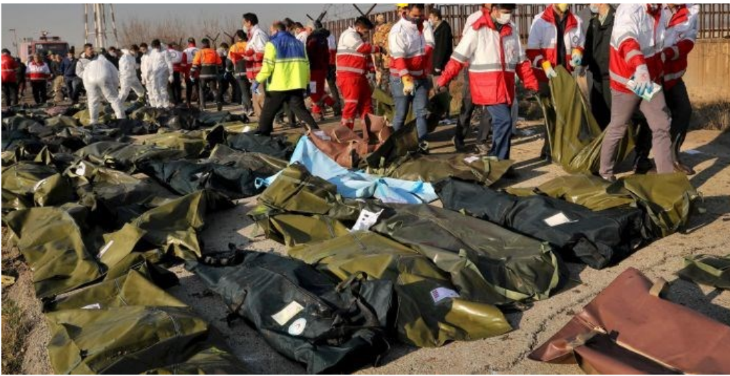
PHOTO: All 176 passengers on board the Ukrainian plane died in the incident.

"We are sorry about this incident and we consider ourselves mournful just like families of these martyrs and sympathise with them," he said.