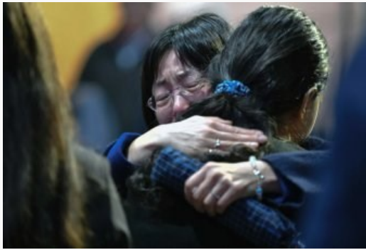
PHOTO: Memorials for those killed in the plane crash have been held across Canada.

"I think the investigation would have disclosed it whether they admitted it or not. This will give them an opportunity to save face."