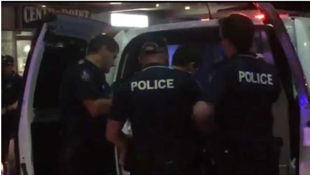
Man arrested after knocking cop unconscious in street brawl