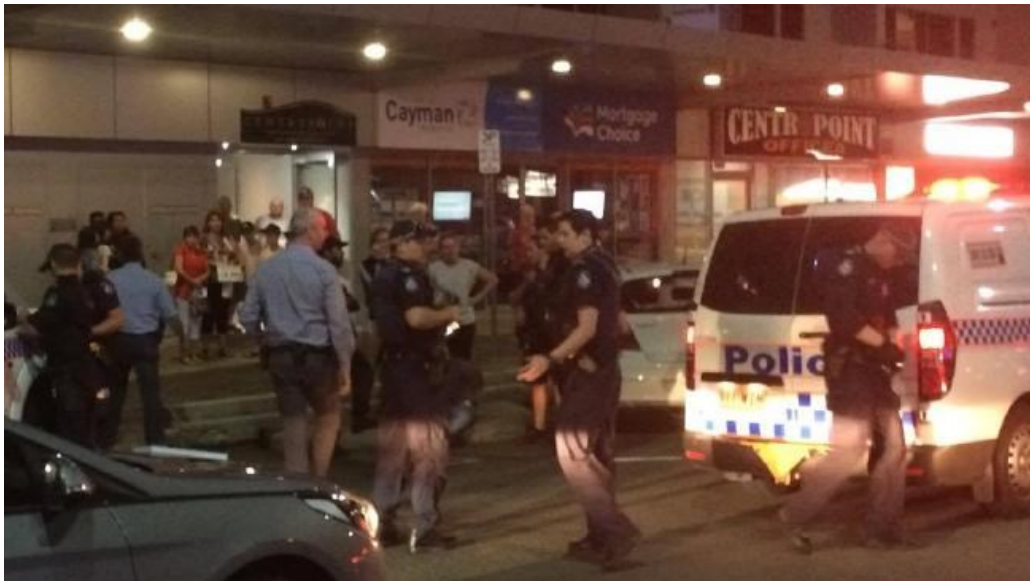
📷 Four men were arrested on Abbott St in Cairns tonight