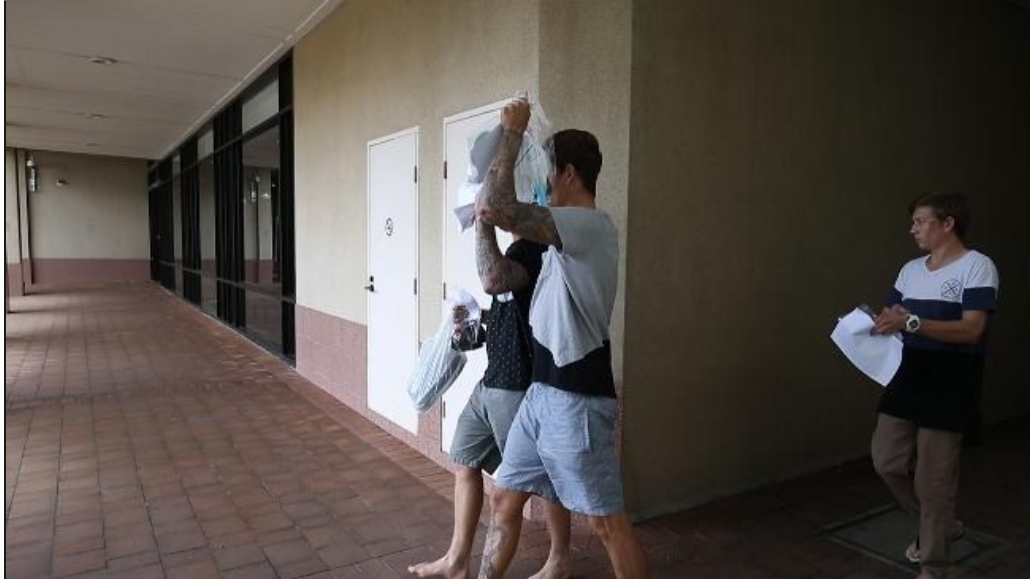
Police furious over alleged assault

“They were in a highly emotional state,” Mr Wettenhall said, adding they were all significantly intoxicated.