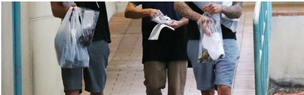
Three men charged with assaulting a Cairns police officer walk free from the Cairns watch house after a magistrate granted all three bail.